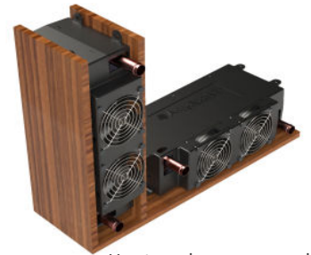
Heat exchangers can be placed vertical or horizontal.